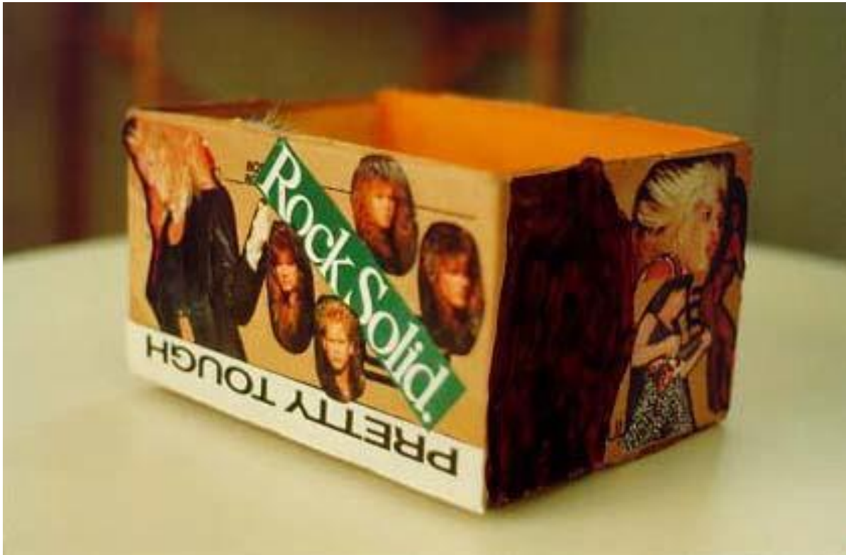
Figure 1. The "Me Box"

Another aspect of this "Me Box" is to go on a treasure hunt to find things on the inside of the house and the outside of the house to add to the box. Photographs, pieces of fabric, or special trinkets that are particularly important to the child, may be put in the inside of the box. Things that you find on the outside of the house that are particular treasures in the garden or on the street and that may reflect ways the world around the child have changed may be added to the outside of the box. In this way your child creates what we call a "Me Box" that completely projects who your child is in his or her world.