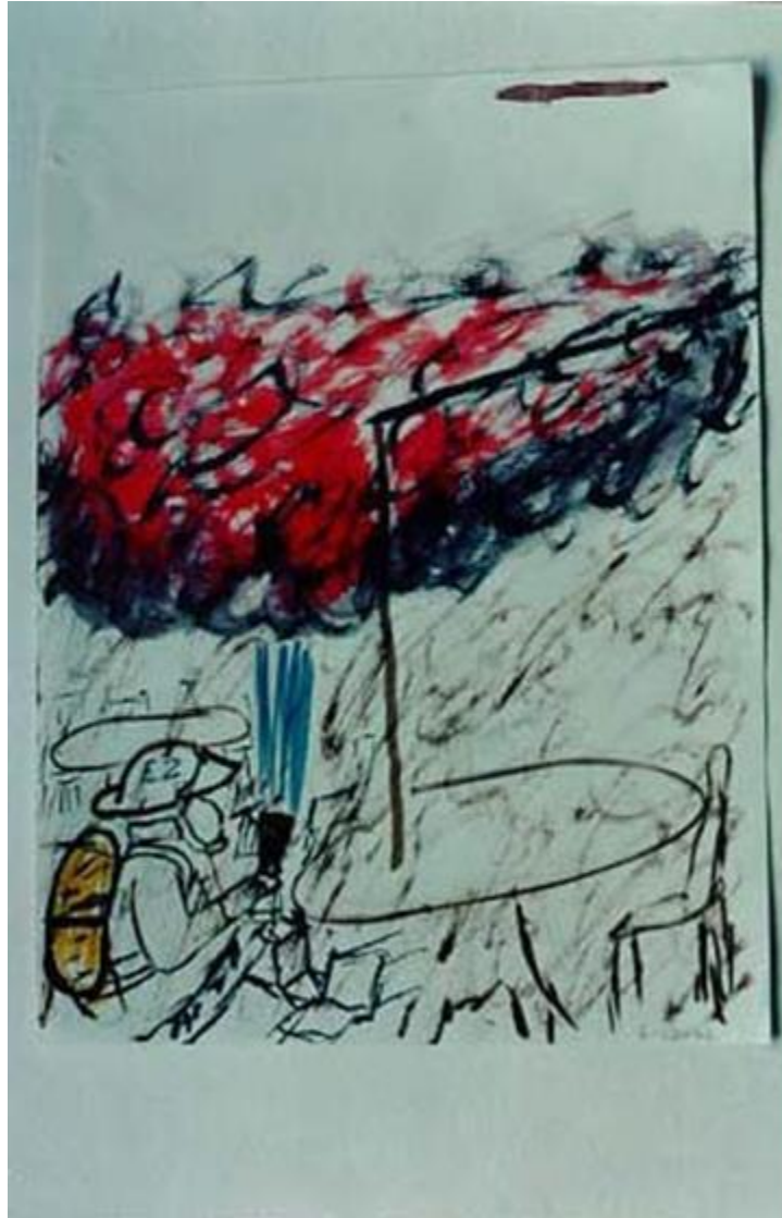
Figure 3. Helpful Characters in the Fantasy Kingdom

triangles can be used. You can also make a 3-D Play Doh or paper mache sculpture of a guardian spirit or a protective character (see Figure 5).