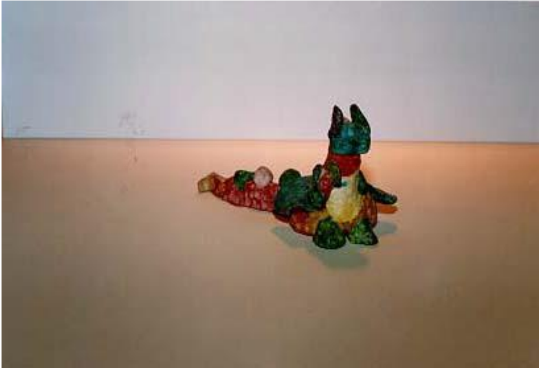
Figure 5. 3-D Guardian Spirit or Protective Figure

be put in about ideas they have had about the disaster. Another section could include ways the world is being put back together in a positive direction. For instance, how people help each other and ideas that your child might have for ways that they can help their family or others. Another section of the art journal could be called “wishes”. This could include drawings or lists of wishes that the child has for himself or herself, for the family, or for other people that your child has heard about or knows. Another section could be maps or safety routes of the house, of ways to stay safe and of plans that can be made to stay safe in situations such as a disaster.