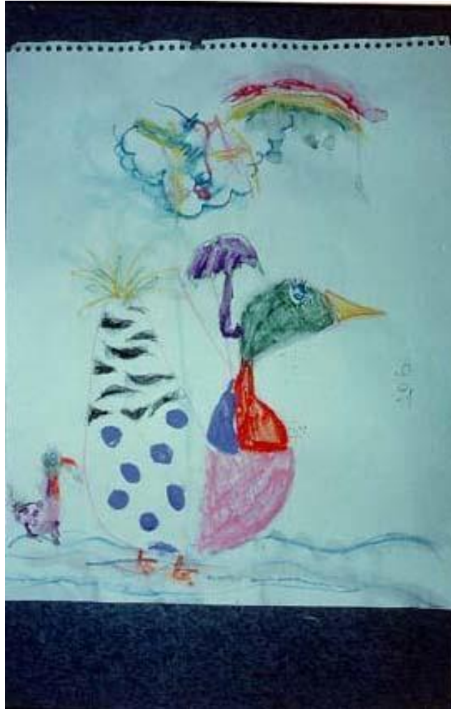
Figure 2. A Once Upon a Time Fairy Tale Drawing or Painting

kingdom where there was a hurricane (flood, earthquake, etc.)” and then let your child fill in the rest of the story by drawing or painting images of what your child thinks happened in this kingdom. Encourage your child to put animals and imagined or real characters in the drawing or painting.