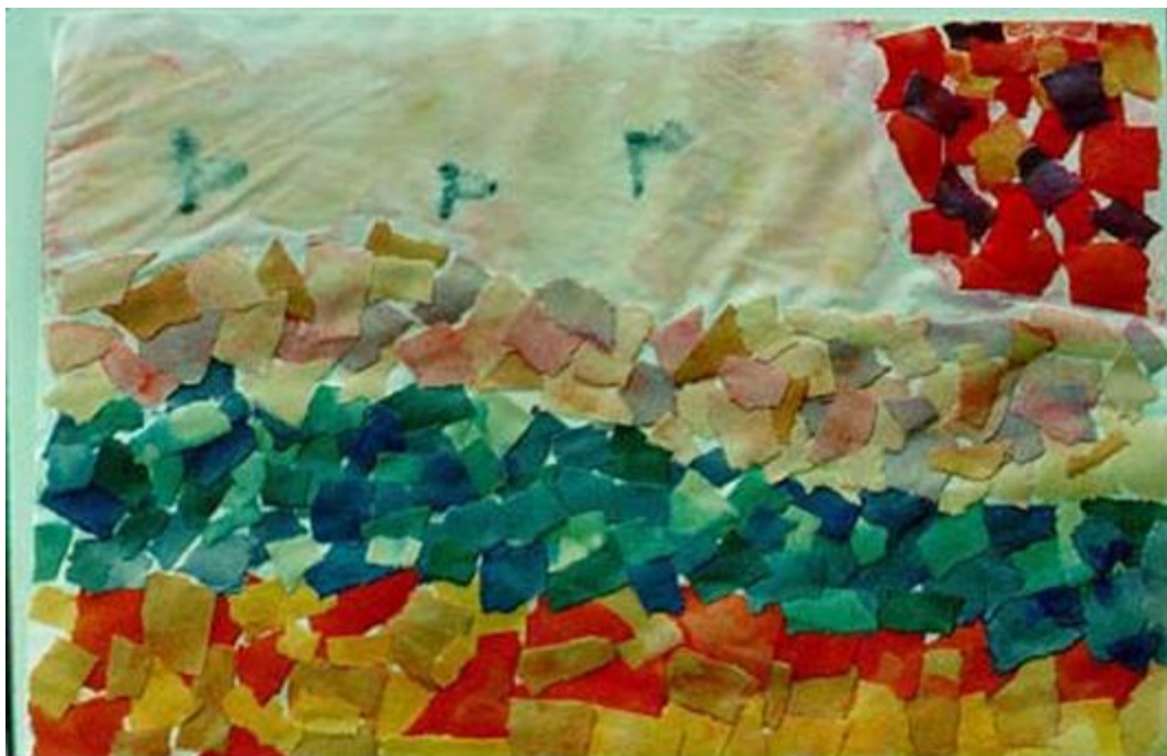
Figure 4. Making a Picture by Tearing Up and Gluing Pieces of Paper