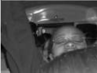
The Bus Ride Down

Last Wednesday the eighth graders attended the play A Christmas Carol at the Guthrie Theatre in Minneapolis. Overall, the eighth graders thought it was cool.